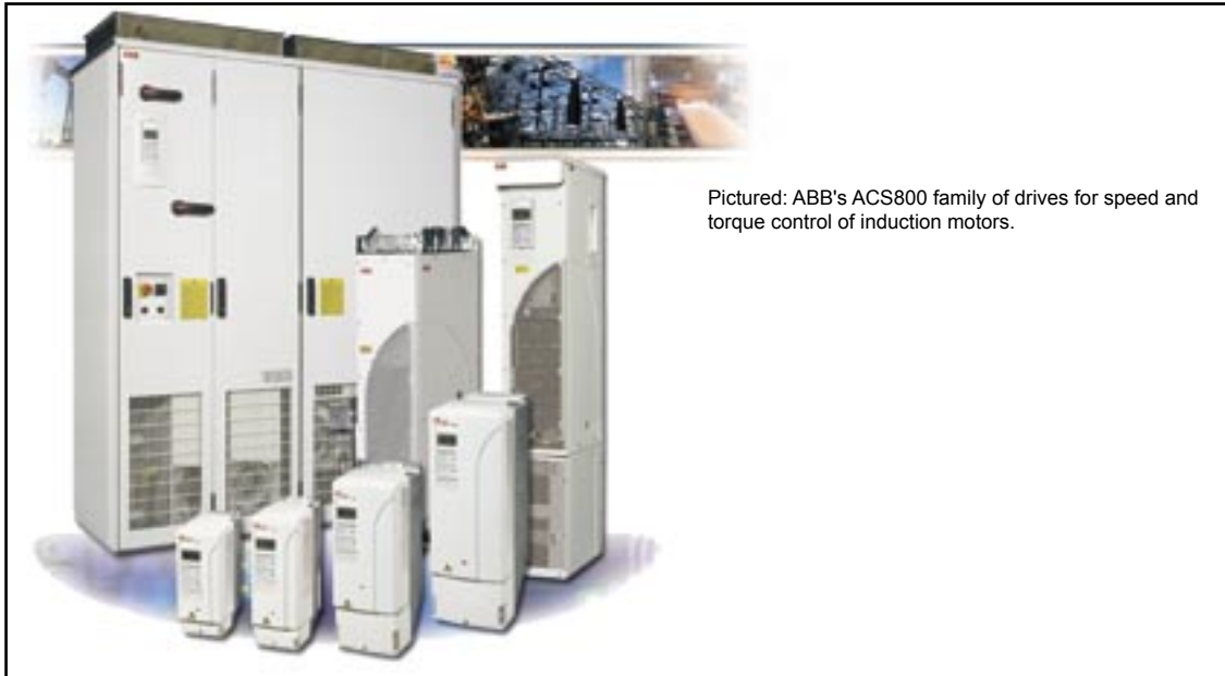
Pictured: ABB's ACS800 family of drives for speed and torque control of induction motors.